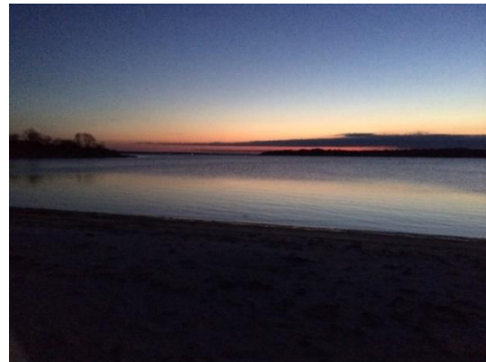
Dock beach at dawn.