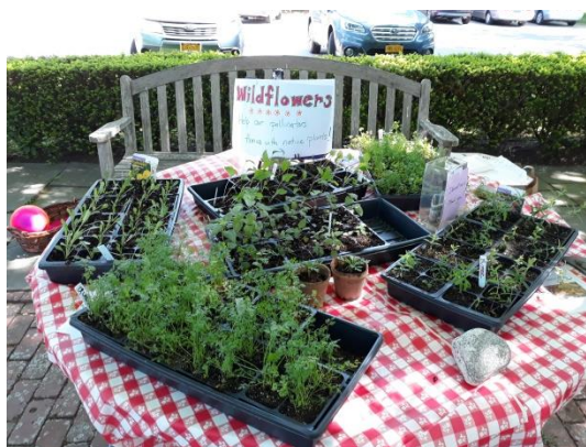
Supporting our pollinators with native flowers