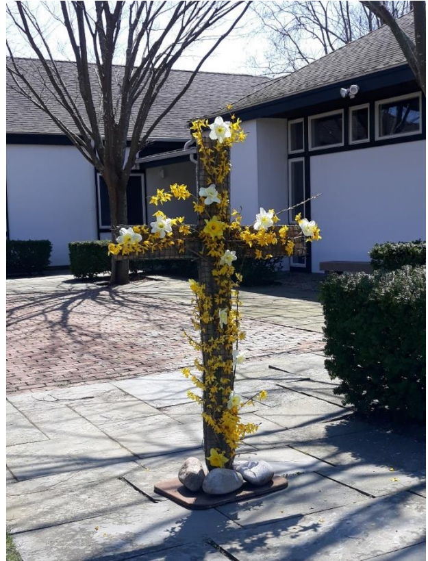
Our courtyard in spring 2020.

-From the Presbyterian (PCUSA) Book of Common Worship