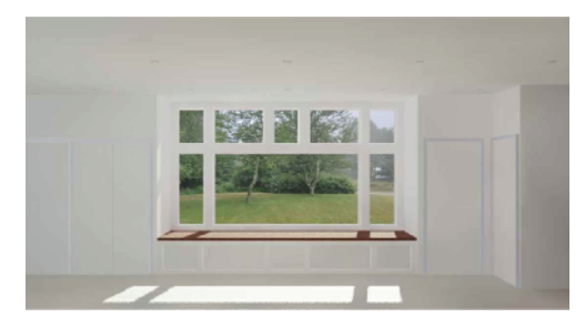
Construction will begin soon on the new Fellowship Hall window

We have accomplished so much! New flooring and a shored up concrete slab underpin so many transformed spaces at the church – the Media Lab, the Parlor, the brand-new kitchen, the light-filled Fellowship Hall and the handsome new entry through the mahogany and glass double doors.